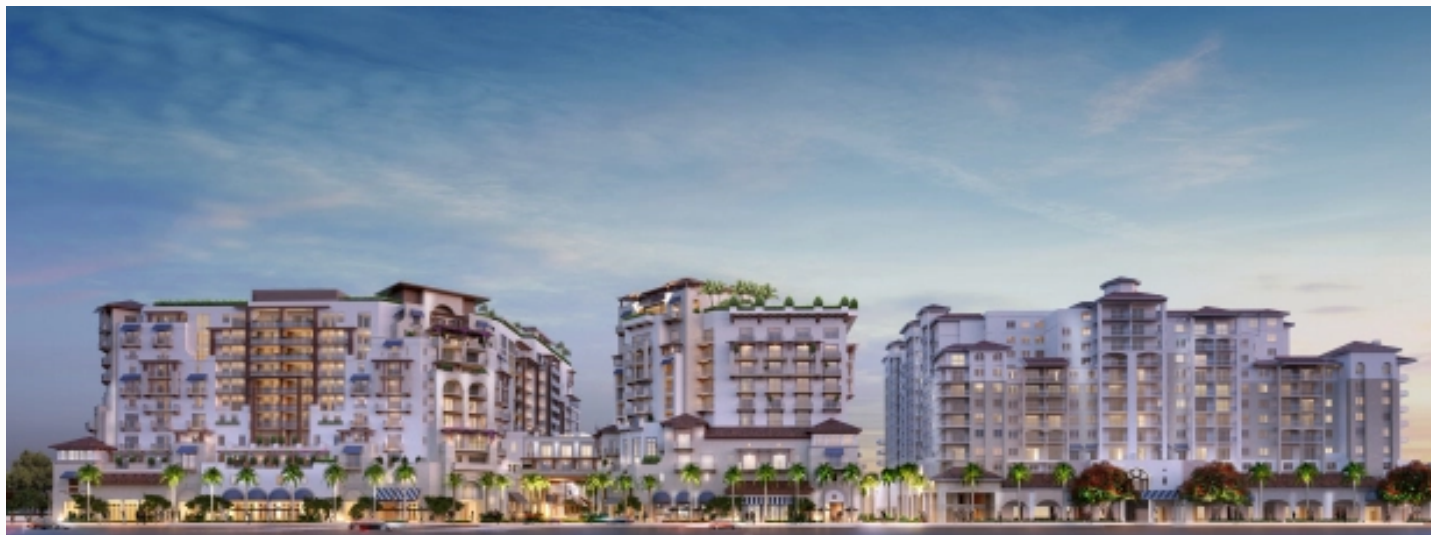
VIA MIZNER.